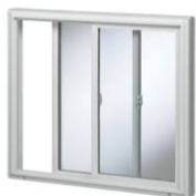
Sliding Window with or without Mosquito Mesh, (Arched or Straight line)