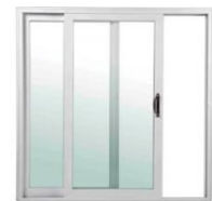
Patio door customized to your size patio sliding doors are customized as per given specifications with or without mesh