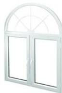
Casement Window Arched or Straight line