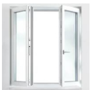
Casement with or without roll down mesh