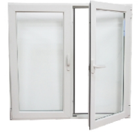
Casement openable @ 90°